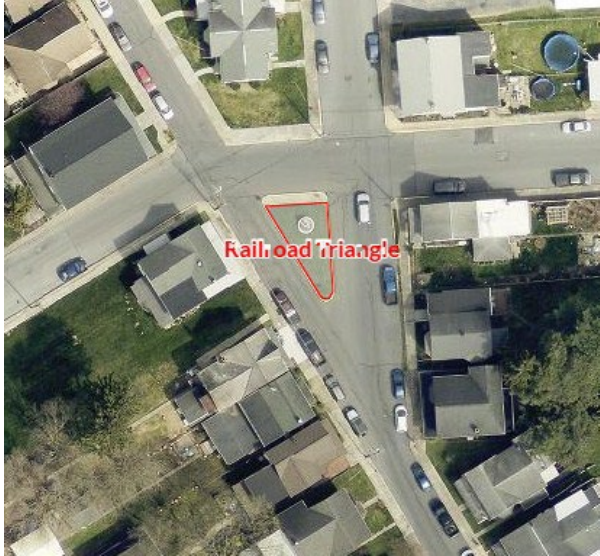
S. Railroad St triangle. Property is located at S. Railroad St. and S. Rosanna St. 802 sq. ft.