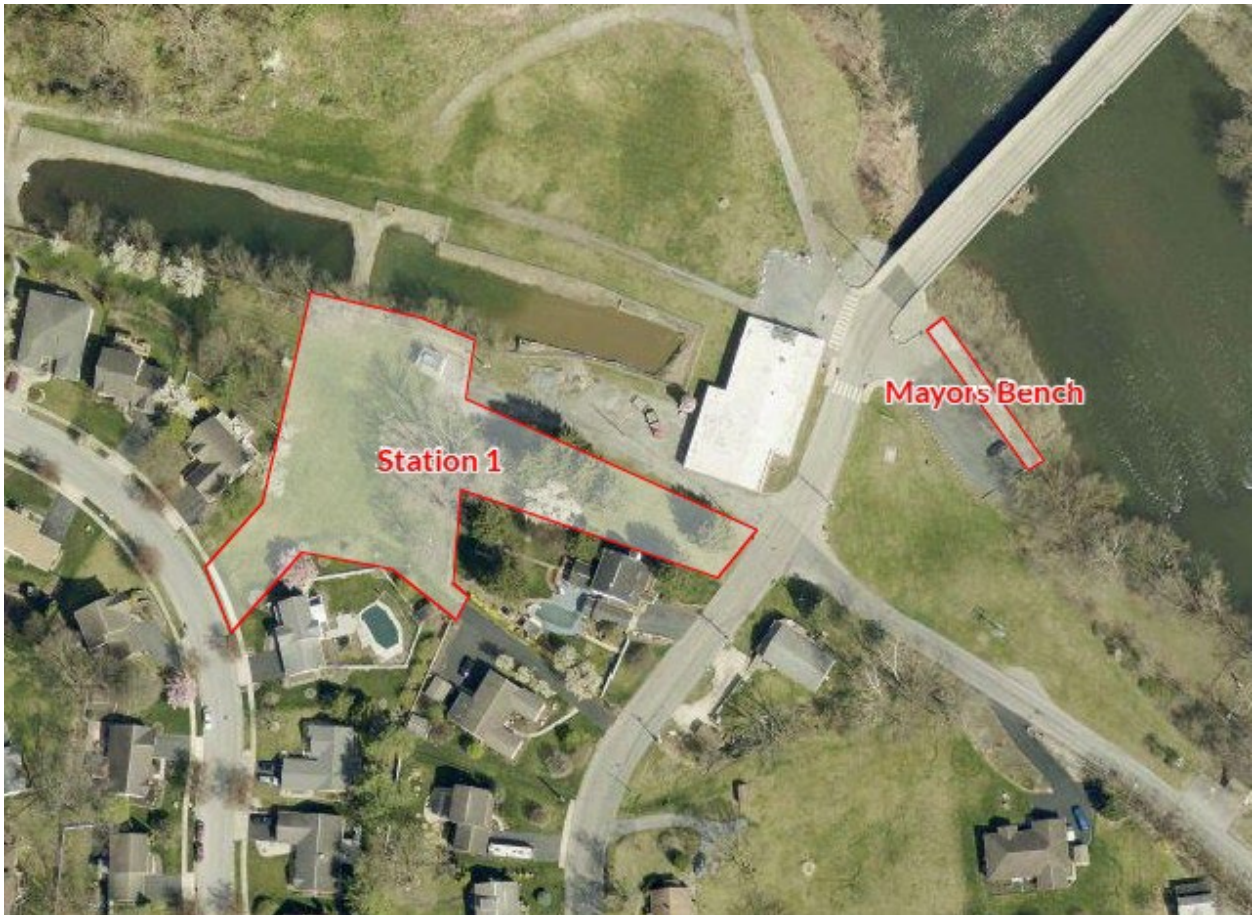
Station 1 and Mayors bench. Property is located to the west and the north of N. Duke St. and N. Railroad St. intersection. 45,658 sq. ft.