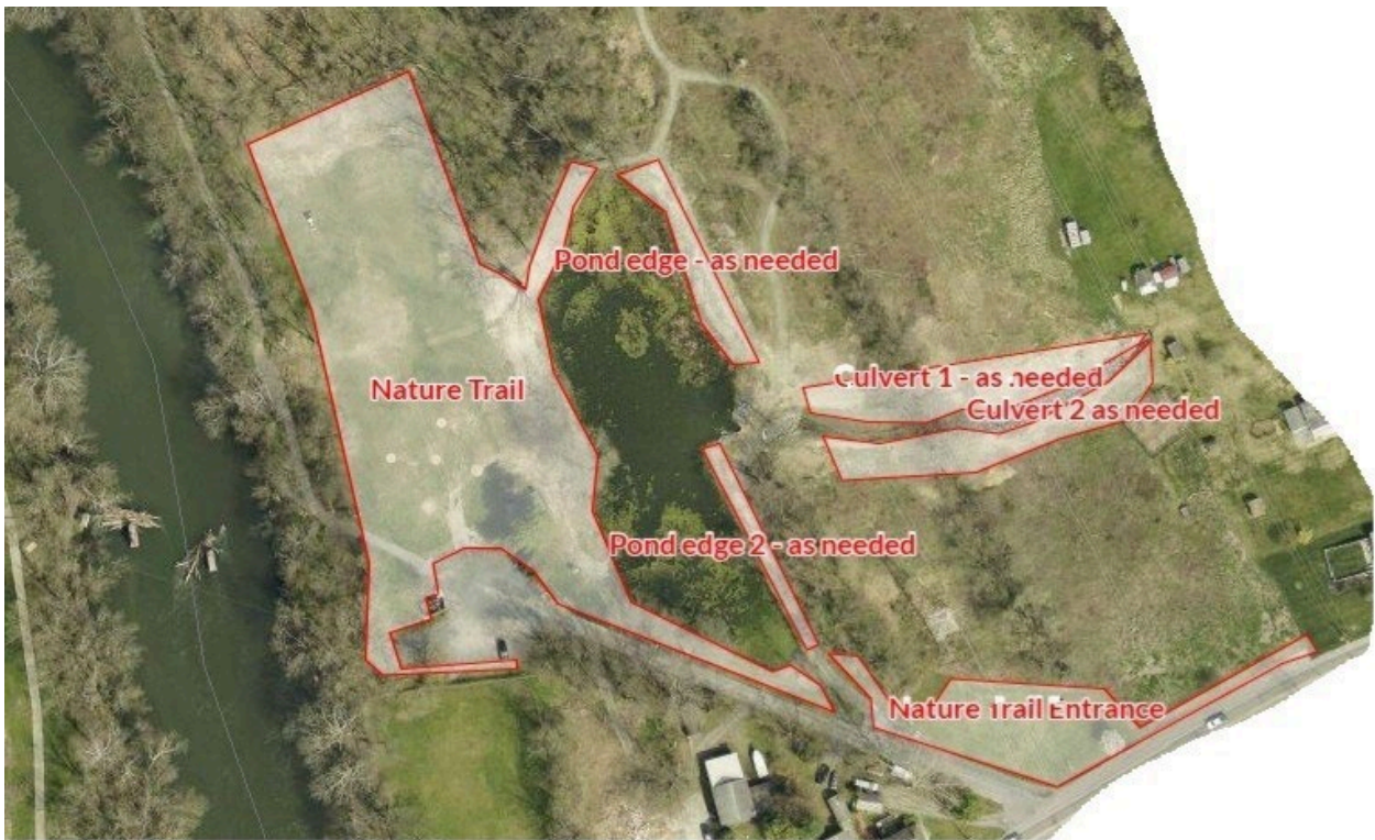
Hummel Nature Trail. Property is located north of the W. Main St. and Fiddler Elbow intersection. 119,032 sq. ft.