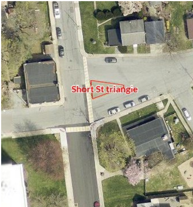
Short St. triangle. Property is located at Short St. and S. John St. 570 sq. ft.