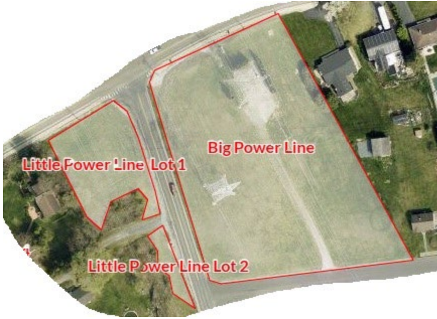
Power Lines. Property is located at the Fiddler Elbow and W. Main St. intersection. 112,605 sq. ft.