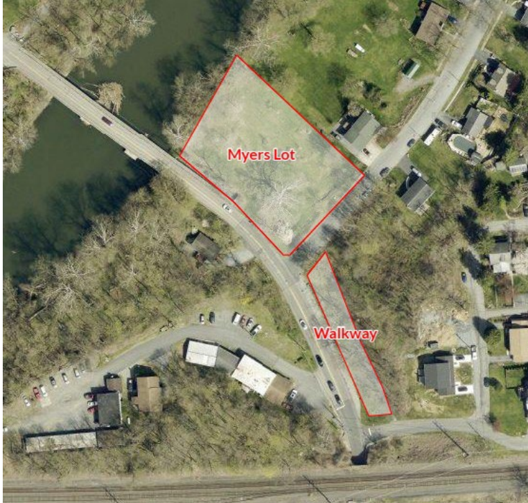
Myers lot and walkway. Property is located at N. Hanover St. and is divided by Kokomo Ave. 54,016 sq. ft.