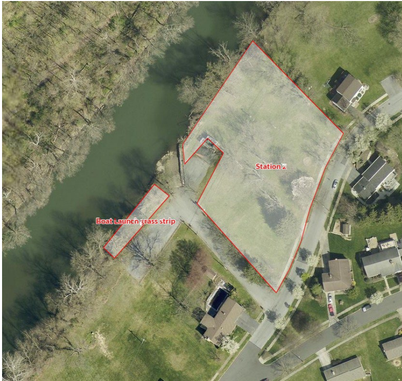
Station 2 and Boat Launch. Property is located at Dock St. 54,680 sq. ft.