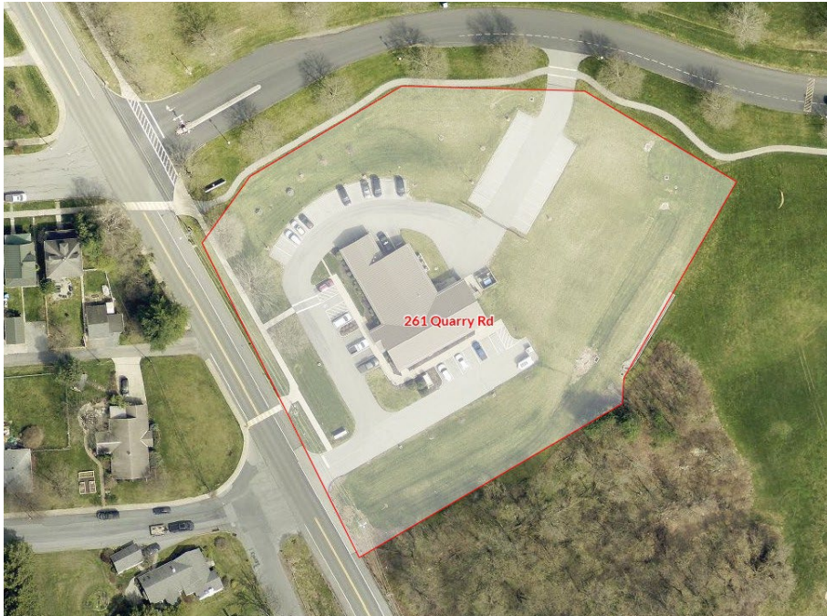
Borough Office. Property is located at 261 Quarry Rd. 94,793 sq. ft.