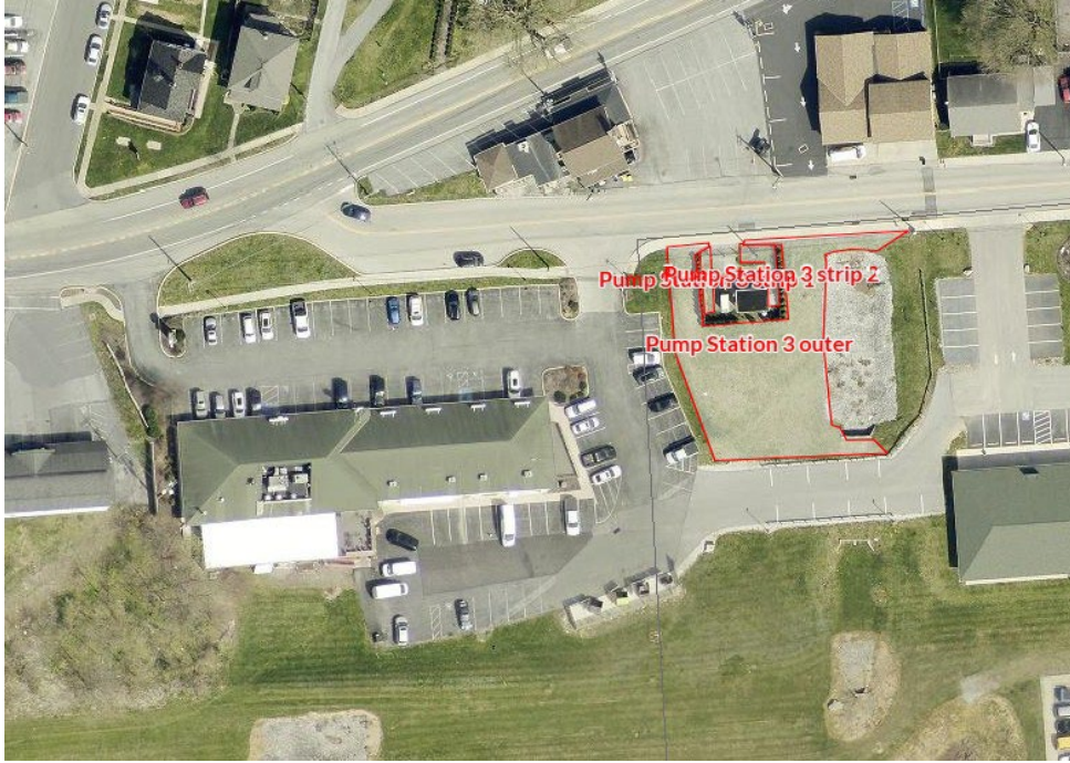
Pump Station 3. Property is located east of the Soda Jerk Restaurant (403 E. Main St.) Grass inside and outside of fence is maintained. 8,364 sq. ft.