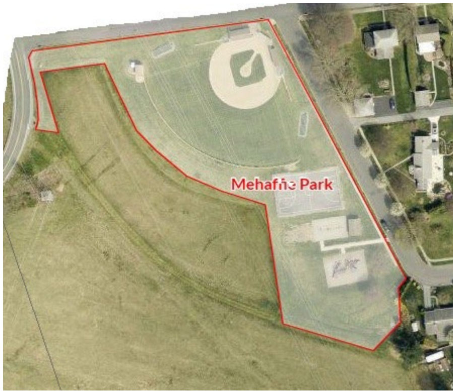
Mehaffie Park. Property is located at the W. High St. and Runyon Rd. intersection. 106,616 sq. ft.