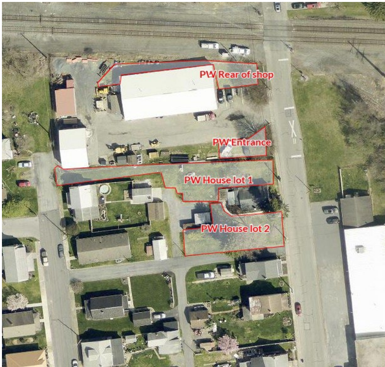
Public Works Office and Garage. Property is located at 120 & 122 N. Duke St. 15,825 sq. ft.