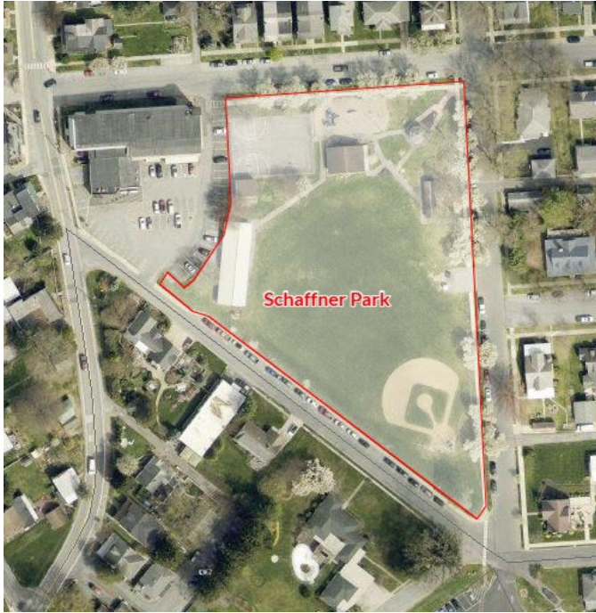
Schaffner Park. Property is located at the corner of Water St. and Poplar Ave. 114,108 sq. ft.