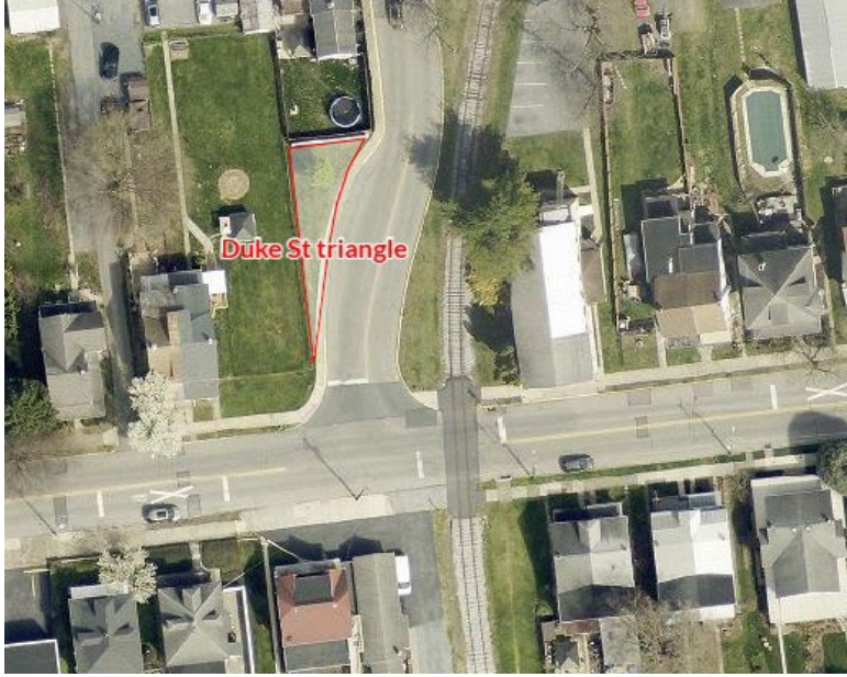
Duke St. triangle. Property is located at W. Main St. and N. Duke St. 1,364 sq. ft.