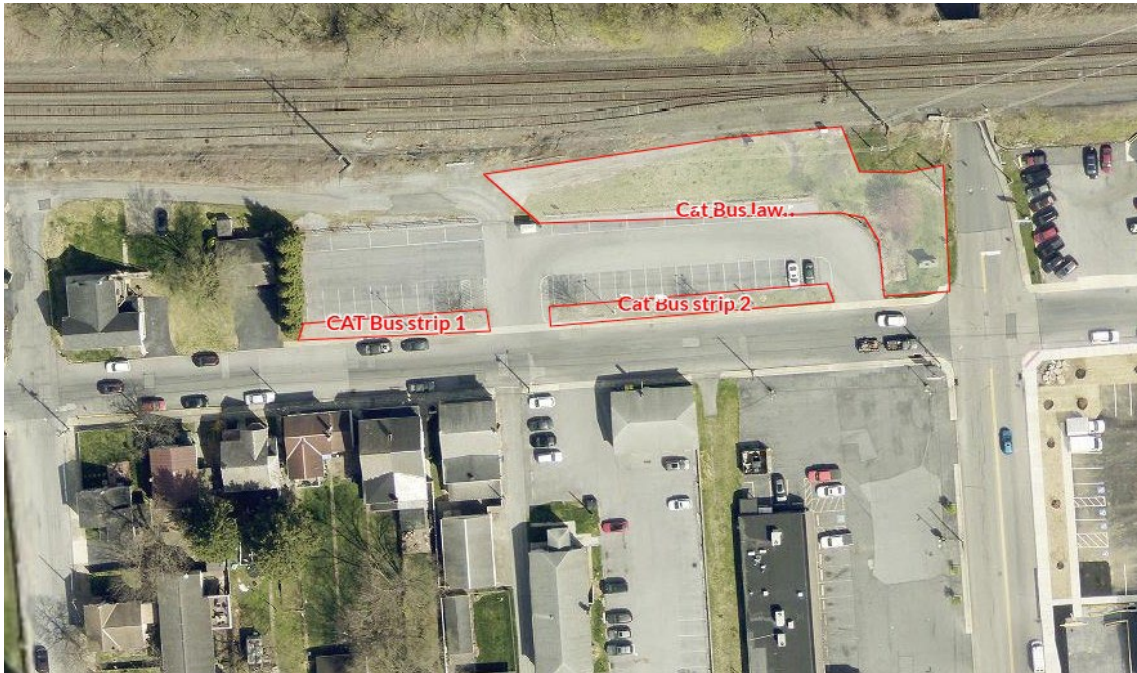
Park and Ride lot. Property is located at the northwest corner of Second and N. Hanover St. 14,296 sq. ft.