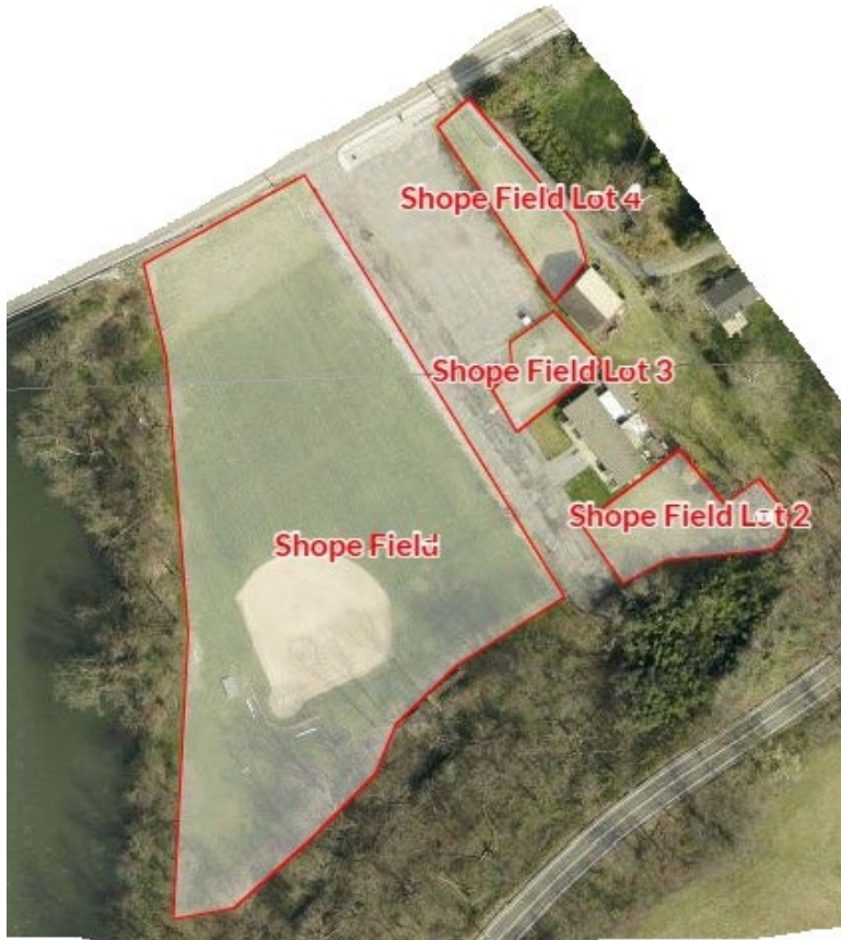
Shope Field. Property is located at Village Ln. 116,241 sq. ft.