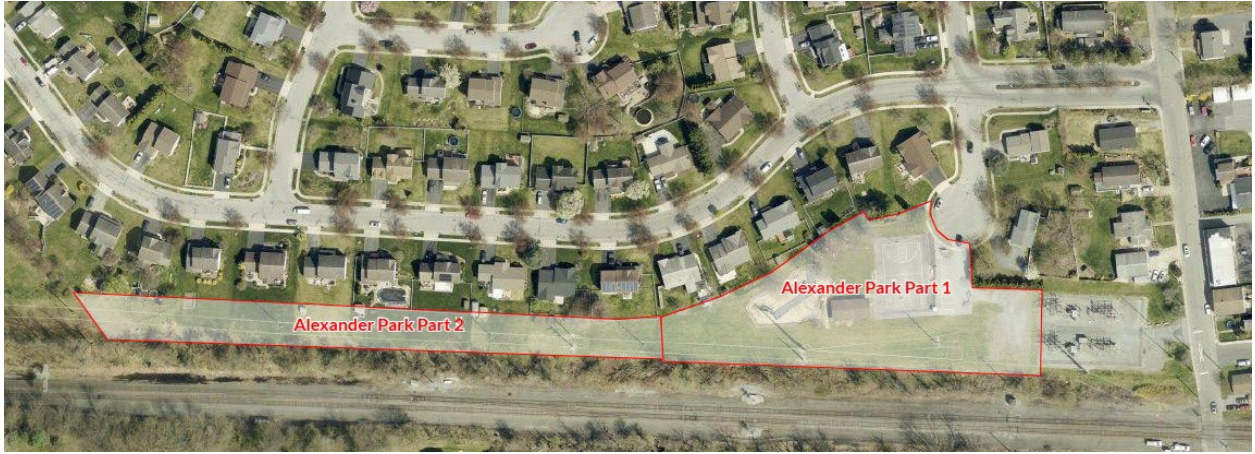
Alexander Park. Property is located at the south cul-de-sac of Sweet Arrow Dr. 122,683 sq. ft.